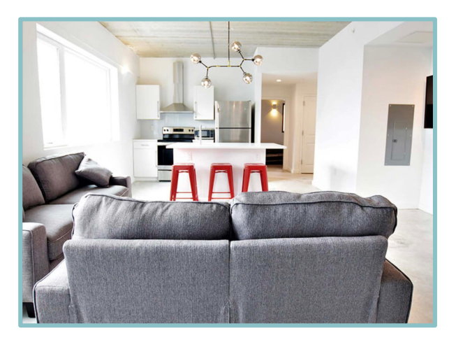
We currently have no MMH students living in these apartments.