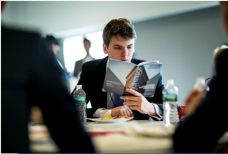
2017 Cornell International Real Estate Case Competition