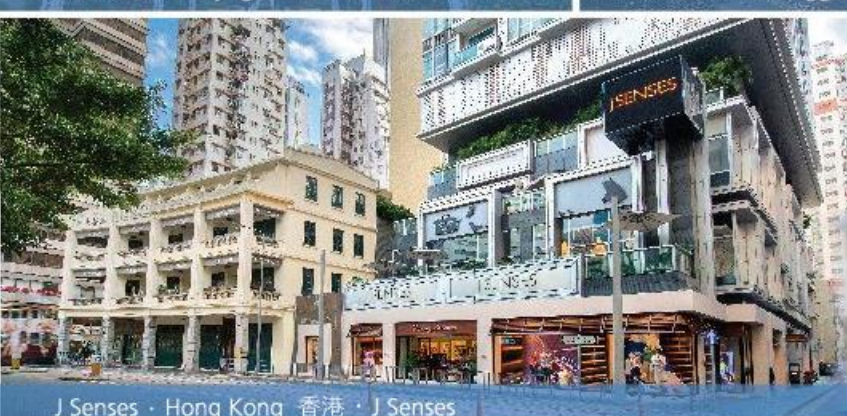
J Senses · Hong Kong 香港 · J Senses