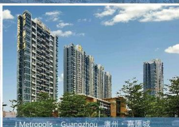
J Metropolis · Guangzhou 廣州 · 嘉匯城

嘉華國際集團有限公司（股份代號：00173）於1987年在香港上市，乃大型綜合房地產發展商及投資者，以香港、長三角及珠三角地區為策略據點，所開發之項目均以品質優見稱，涵蓋精品住宅、甲級商廈、特色商舖、酒店及服務式公寓。集團旗下物業揉合特色設計、精湛技術、頂尖設備及創新元素於一身，多年來備受市場認同，建築及設計屢獲國際殊榮。