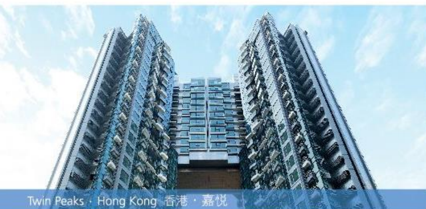
Twin Peaks · Hong Kong 香港 · 嘉悅