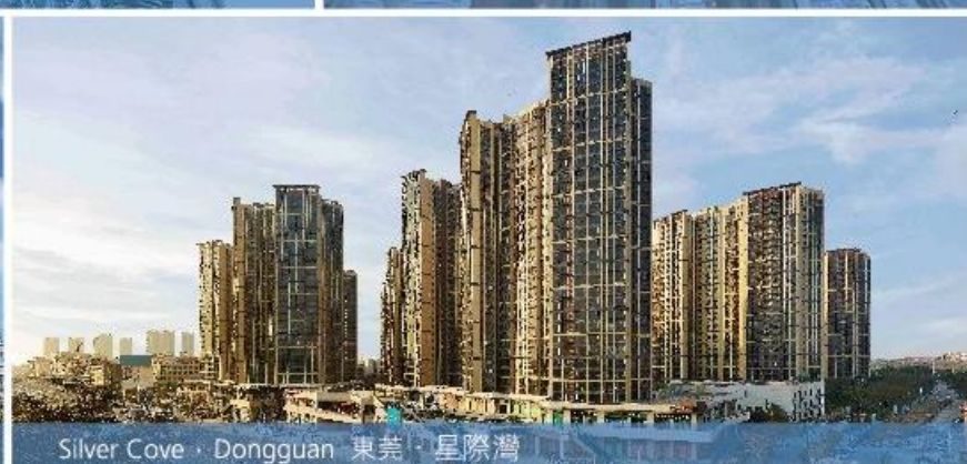
Silver Cove · Dongguan 東莞 · 星際灣