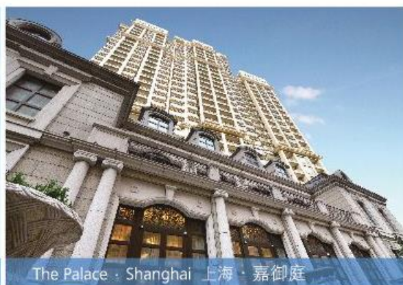
The Palace · Shanghai 上海 · 嘉御庭