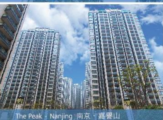
The Peak · Nanjing 南京 · 嘉譽山